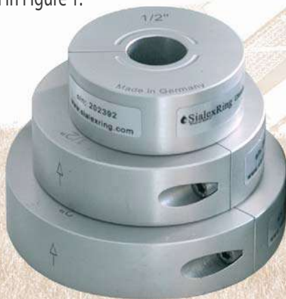
Figure 1 Sialex®Ring Device

The company has proposed an innovative anti-scale ring. And corrosion Sialex®Ring with research and production from Germany Accepted both in and abroad general characteristics as shown in Figure 1.